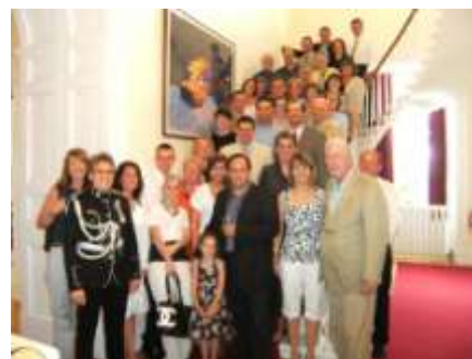
Lieutenant Governor, The Honourable John C. Crosbie, with PHF recipients, their families and Club members at Government House, July 23